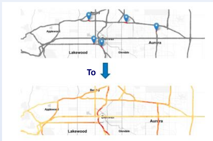
Ubiquitous Traffic Volume Data